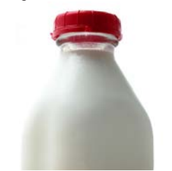
Milk 1 gallon, fat free