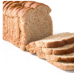
Bread 2 lbs.