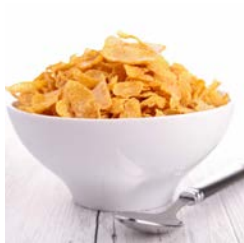
Corn Cereal 18 oz. box