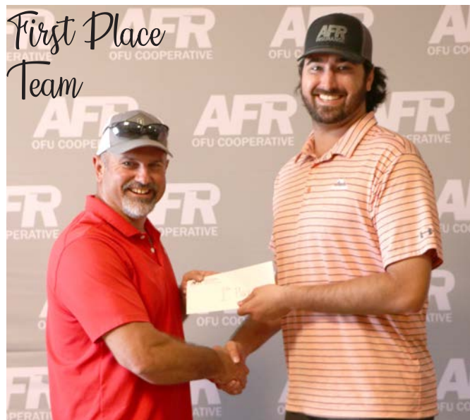
First Place Team