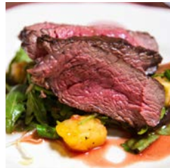
Top Sirloin Steak 1 lb.