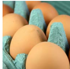
Eggs 1 dozen