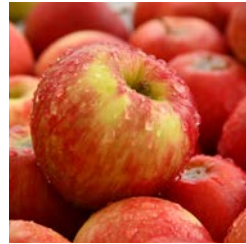
Fresh Apples 1 lb.