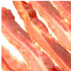
Bacon 1 lb.

Did you know that farmers and ranchers receive only 14.3* cents of every food dollar that consumers spend? According to the USDA, off-farm costs including marketing, processing, wholesaling, distribution and retailing account for more than 80 cents of every food dollar spent in the United States.