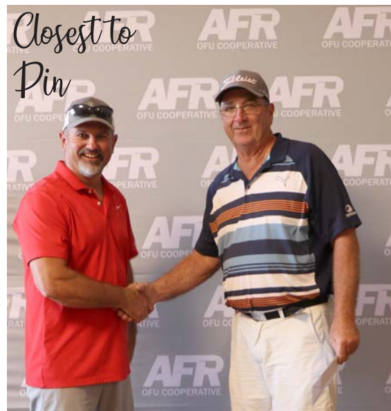
Closest to Pin