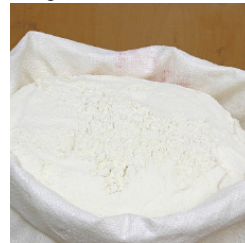
Flour King Arthur, 5 lbs.