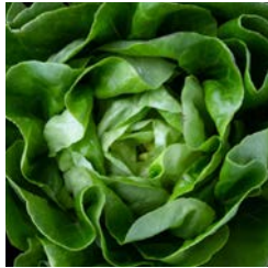
Lettuce 1 lb.