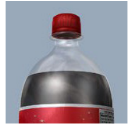
Soda 2 liters