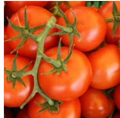
Tomatoes 1 lb.