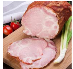
Boneless Ham 1 lb.